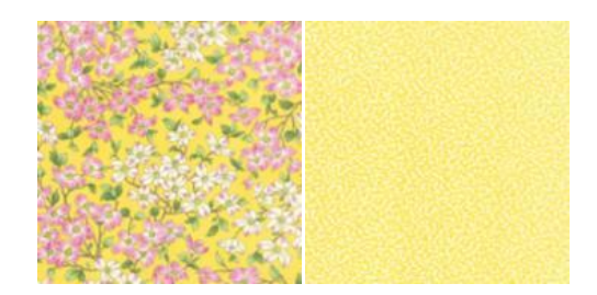
From P & B: